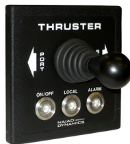
Spring Centered or Put & Stay

Single-stage or fully variable (proportional) controls. Proportional configuration permits the output of the thruster to be throttled by the operator and features a PLC (Programmable Logic Controller) specifically programmed for the application. Controls are housed in a single, durable enclosure for ease of installation. Easily fitted with numerous joystick controls. Most NAIAD thrusters are powered by a Naiad Integrated Hydraulic System (IHS). The PLC is easily configured to control many ancillary hydraulic shipboard systems.