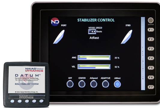
DATUM™ graphical display panel options, each with intuitive multi-page display screens.