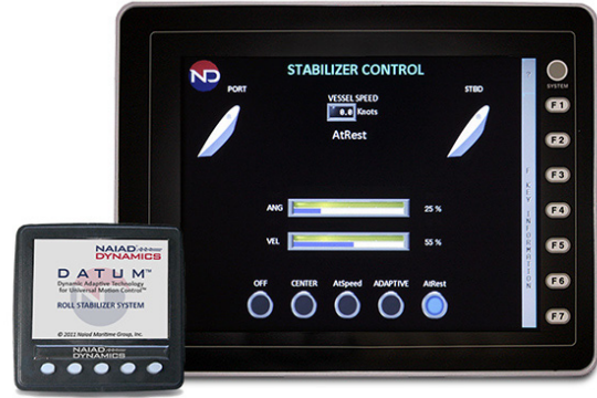
DATUM™ graphical display panel options, each with intuitive multi-page display screens.