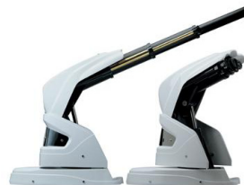
Deck Crane / Davit